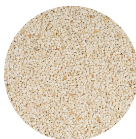
Marfil Size: 1-3 and 2-6 mm