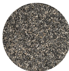
Dark Grey Size: 1-3 and 2-6 mm