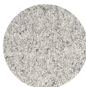
Light Grey Size: 1-3 and 2-6 mm