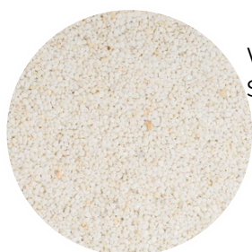
White Size: 2-4 mm

With the STONECARPET range, the variety of finishes is endless. Using only marble stone, we offer a wide palette of colors and grain sizes to adapt to any style and preference. Marble stones can be mixed, achieving endless possibilities.