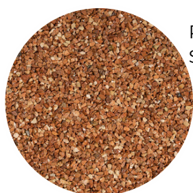
Red Size: 1-3 and 2-6 mm